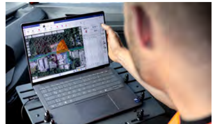
Simple and clear display

“Using the LaserGasPatroller LGP 800 in our electric vehicles makes us one of the first companies in Austria to be prepared for the requirements of the EU Methane Regulation – while being consistently focussed on sustainability.”