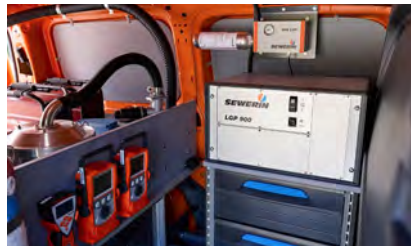
Example of installation in the vehicle