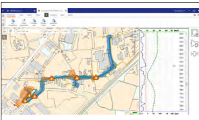
SeCuRi® SAT software